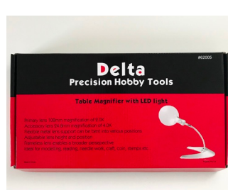
Shelf pack – 6 pcs.

Primary lens of 108mm features 2.0 x magnification. Accessory lens of 24.8mm features 4.0 x magnification. Flexible metal lens support can be bent into many positions. Ideal for modelling, reading, craft, needle work, coin and stamp collecting and much more.