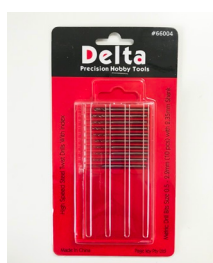
Shelf pack - 6 pcs.

10 pieces High Speed Steel Shank Drill Bits ranging from size 0.5mm to 2.2mm, all with 2.5mm shank. Ideal for use in powered rotary tools. All contained in a numbered storage drill index.