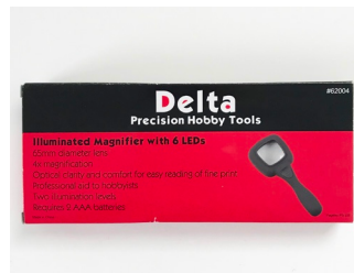
Shelf pack – 6 pcs.

Hand held magnifier featuring 65mm diameter lens of optical clarity for easy viewing of fine details and print.. 4 x magnification. Two levels of illumination.