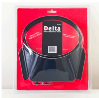
Shelf pack – 6 pcs.

The Magvisor magnifier actually has three levels of magnification. One level is 2.2 times, and is always visible to both eyes. However, inside the visor is a flipdown magnifier which provides an additional level of magnification. Finally there is the attached eye loupe, which can be positioned on either side with a screwdriver. So the magnifier provides 2.2 to 4.8x levels of magnification. Lenses are acrylic. In addition, there are two LED light pods (each powered by two AAA batteries) to shed extra light on the object being worked upon.