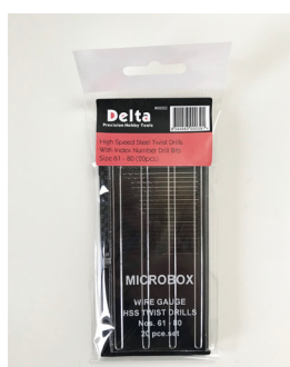
Shelf pack - 6 pcs.

20 pieces High Speed Steel Number Drill Bits ranging from size 61 (0.039", 0.99mm) to size 80 (0.0135", 0.343mm). All contained in a numbered storage drill index.