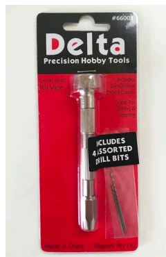
Shelf pack - 12 pcs.

This swivel head pin vice is ideal for holding drill bits, reamers, needle files, screws, taps, wires...even pins. The free swivelling hexagonal head means that it is especially suited for drilling and tapping, with its fast turning action. The two reversible collets feature four chucks, which are capable of holding micro size drill bits from 0 to 0.125 inches.