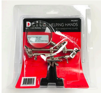
Shelf pack – 6 pcs.

The ideal tool to provide you with a much needed helping hand! This tool is ideal for securely holding any work, freeing up both your hands to work with. It features a solid cast iron base, a glass magnifying lens and two alligator clamps to securely hold your work.