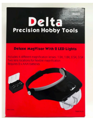
Shelf pack – 6 pcs.

Includes four different magnification interchangeable lenses – 1.2 x, 1.8 x, 2.5 x, 3.5 x, complete with convenient storage case. Light features two LEDs.