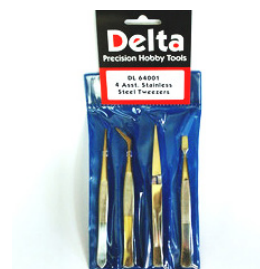
Shelf pack – 12 pcs.

Four 120mm stainless steel tweezers comprising the most wanted types – straight, pointed, self-closing, curved and stamp/decals – contained in a quality vinyl storage pouch. Very attractively priced, this one of our most popular line of tweezers.