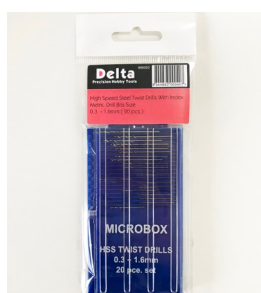
Shelf pack - 6 pcs.

20 pieces High Speed Steel Metric Drill Bits ranging from size 0.3mm to 1.6mm. All contained in a numbered storage drill index.